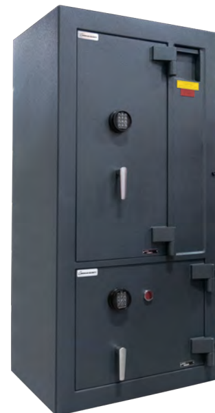
ACE with two door