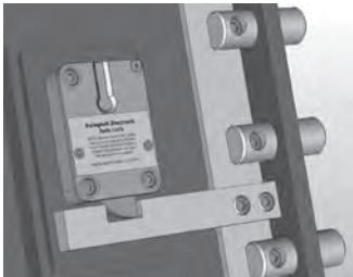
SWING BOLT LOCK