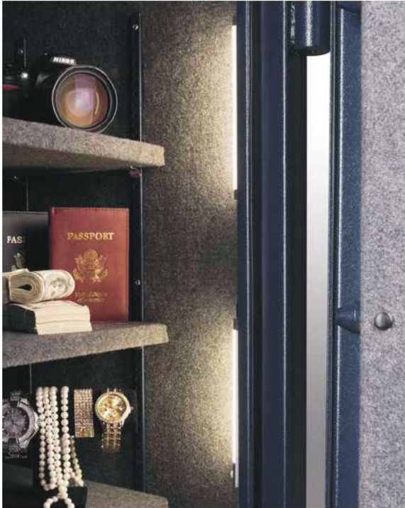
8-in. Light Kit

Has (2) 36" light strips with high-intensity white LED lights and a motion sensor that automatically turns the lights on when motion is detected. The lights turn off 30 seconds after motion has stopped. This light kit can be installed on any American Security safe and is also available as a retrofit kit.